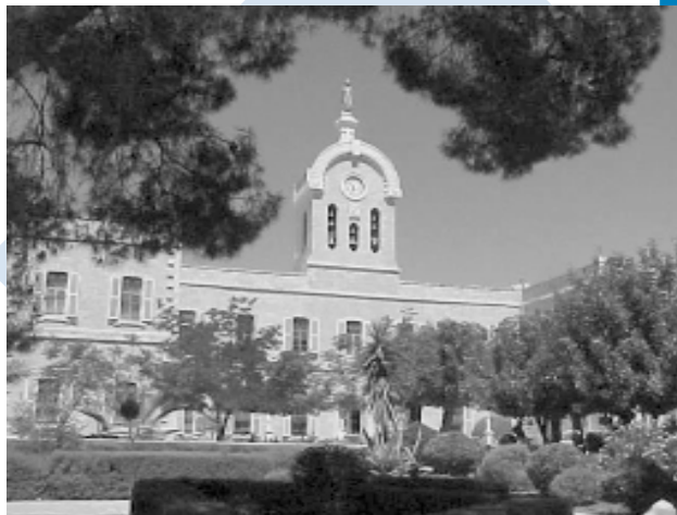
Arriving in Jerusalem in 1876, the Christian Brothers founded secondary schools in Jerusalem, Jaffa, Haifa, Nazareth, and Bethlehem. Pictured is the first building in Bethlehem, opened in 1893, now part of the University but originally a novitiate and a secondary school. The Ecole des Frères secondary school still operates in Bethlehem, as do the schools in Jerusalem, Jaffa, and Nazareth. The Near East Region of the Brothers also maintains schools in Jordan, Lebanon, Turkey, and Egypt.