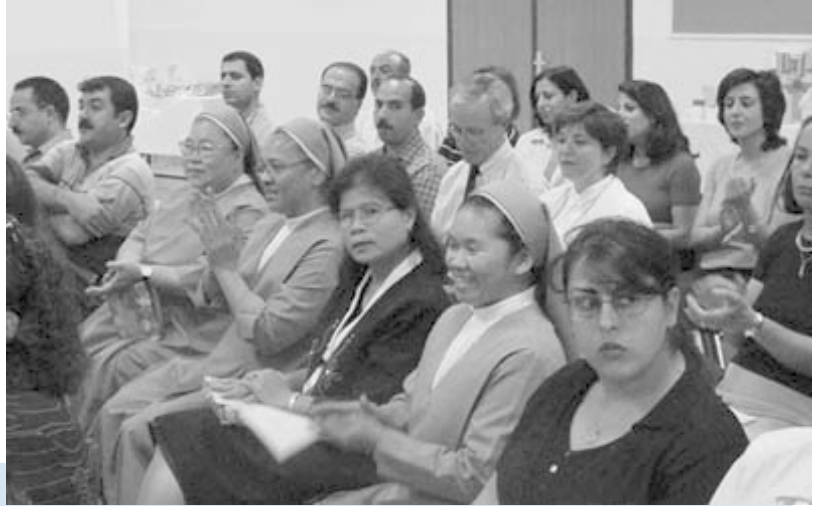
Staff Recognition Day, September 2002. The faculty and staff number about 260, 13 of them Christian Brothers. About half of the faculty and staff are alumni of Bethlehem University.