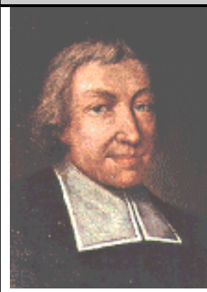
St. John Baptist de La Salle - Official Portrait By Leger