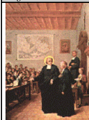
St. John Baptist de La Salle at Saint Sulpice school.