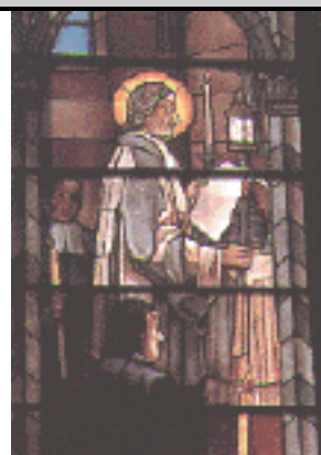
The Heroic Vow, 1691. Stained glass window in Rome.