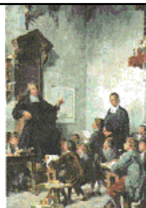
St. John Baptist de La Salle teaching class. By Cesare Mariani