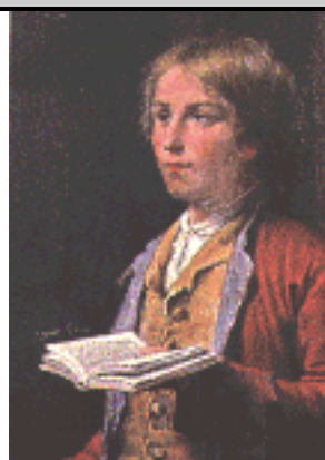
Student monitor detail from Gagliari painting.