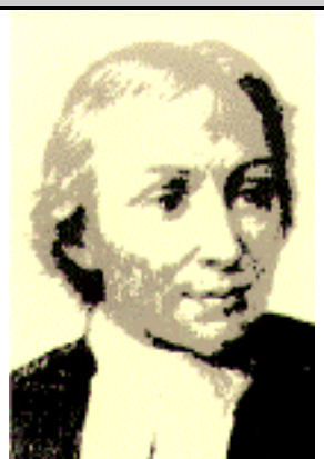
St. John Baptist de La Salle.