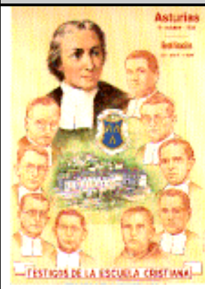
Martyrs of Asturia Artist Unknown